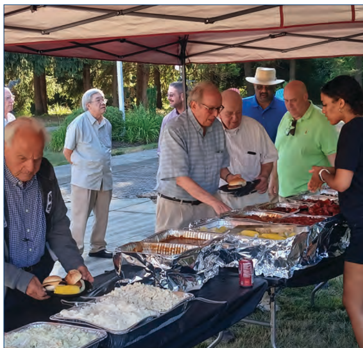
After the Friday Mass at De La Salle Hall honoring resident Jubilarians, Brothers enjoy a barbeque.

These celebrations of the Brothers' vocation were inspirational for all. Please join us in praying for many more years of faith and service for each of these wonderful men.