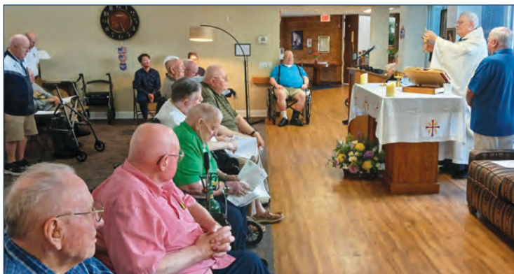
Nearly eighty Brothers attended a special Mass at De La Salle Hall for resident Jubilarians.