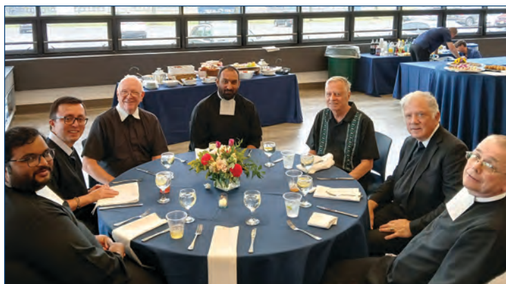
Brothers gather for a luncheon and comradery following the Jubilarian Mass and renewal of vows.