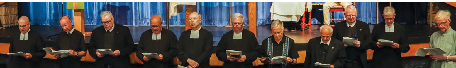
Jubilarian Brothers recite their renewal of vows at the Mass and celebration in their honor.