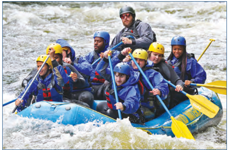
LaSalle School students experience fun, growth, and teamwork during summer excursions.

Off campus, social workers and case managers in the Counseling Center at LaSalle (CCL) , provide behavioral health services to over 200 youth daily. The CCL is the only behavioral health clinic in the Capital District dually licensed by the NYS Office of Mental Health and Office of Addiction Services and Supports to specialize in the care of youth and families. Recently, LaSalle also created the Ulster County School Support Team , an innovative new program designed to address the effects of trauma, increase school engagement, and bolster mental health resources for youth in the county's nine school districts.